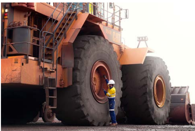
Figure 3. Inspection teams identify any issues to improve tyre life, costs and productivity and uptime.

those insights could inform tyre rotation intervals and spare tyre stock planning.