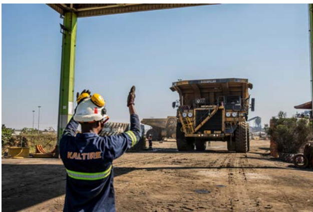
Figure 2. A team member directs a haul truck into the bay for tyre service.