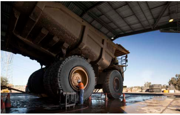
Figure 6. Ensuring all necessary tyre maintenance is performed while a haul truck is in the bay.

Secondly, in winter months, more planned tyre rotations could be made to stockpile spares for the higher demand seasons. That way, tyre teams can better accommodate high season demand, spreading out the tyre work and reducing unnecessary truck downtime during summer months.