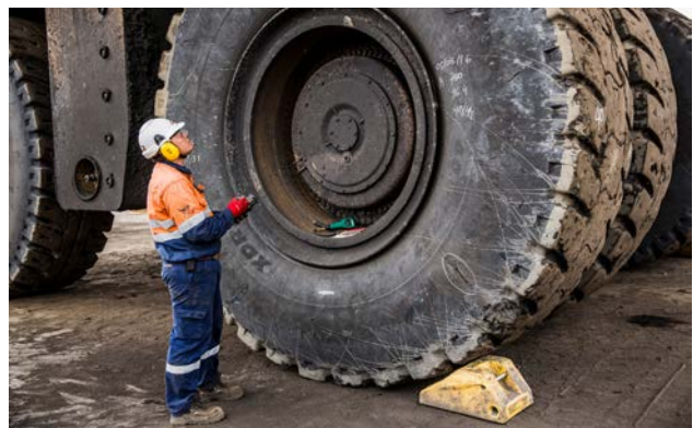
Figure 4. A Kal Tire team member inspects a tyre on-site.

Firstly, that tyre management teams could intentionally install new tyres to the rear axle to generate more used spare tyres, thereby reducing the number of downtime events and extending the time period that tyres remain on front positions. The additional risk of increased tyre damage – with new tyres being fitted to the rear – would be more than covered by the productivity savings by avoiding excess truck downtime.