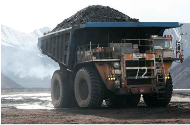
Figure 1. A haul truck carrying a full load on a mining site.

In Canada, where wet conditions in spring and autumn can lead to premature tyre damage, seasonal variability plays a big factor in tyre fitment strategy and as a result, stock inventory levels. Equipped with TOMS data, the case study team was keen to find out how spare stock demand and availability changed throughout the year, and how